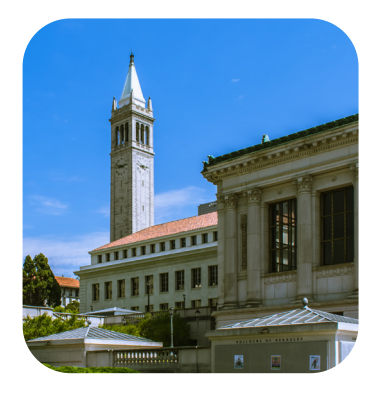
Thousands of families have trusted Elite to guide them into their top-choice UC schools